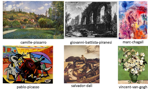
Figure 3: Images in “Artist Dataset”.

the VGG-16 network [9]. In addition, we also examined the combined style vectors of all the five layers as well. Finally, we compared performance with Karayev et al. [5] using the same dataset.