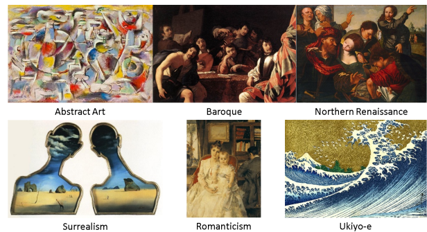
Figure 2: Images in “Style Dataset”.

For experiments, we prepared an artistic pictorial image dataset which contains metadata on image style and artists by gathering them from Wikiart.org, and classified them with style vectors extracted from five intermediate layers (conv1_1, conv2_1, conv3_1, conv4_1, and conv5_1) of