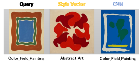
Figure 5: Similar images to a sample of “Color Field Painting” by a style vector and a CNN feature.