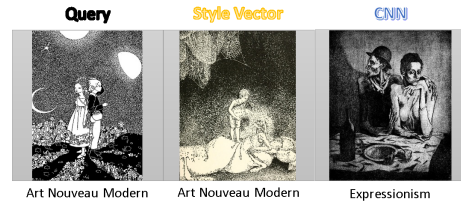
Figure 4: Similar images to a sample of “Art Nouveau Modern” by a style vector and a CNN feature.

Although the most effective style vector was S^{conv5.1} in