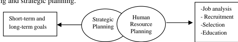
Fig 1. The link between strategic planning and human resource planning

mission, vision, values, environmental scan, goals, strategies, responsibilities, time lines, budgets, etc. In other words, if an organization operates in a stable market for many years, then planning might be carried out once a year and only in certain parts. The human resource planning is a process for assessing the demand and evaluating the size and the nature of supplies which will be required to meet the demand and therefore in the first stage of every staff and human resource management programs human resource planning is used. Human resource planning is directly linked with strategic planning and institutional policies. It is the main tool which aims to connect the organizational goals to the programs and goals of human resource. Figure 1 shows that there is a close relationship between human resource planning and strategic planning.